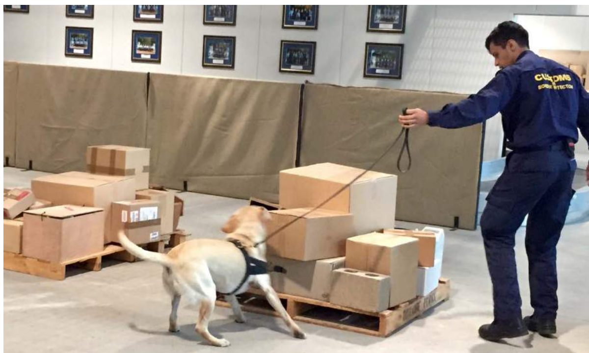
Figure 2.1: Customs' officer and dog searching pallet for explosives as part of a training exercise

1.83 The committee also observed younger dogs honing their natural instincts for searching through exercises conducted with their trainers: