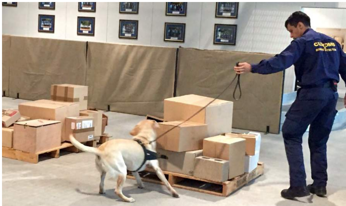
Figure 2.1: Customs' officer and dog searching pallet for explosives as part of a training exercise

2.47 The committee also observed younger dogs honing their natural instincts for searching through exercises conducted with their trainers: