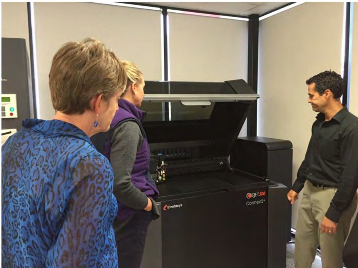
Figure 3.1: Committee members inspect a 3D printer