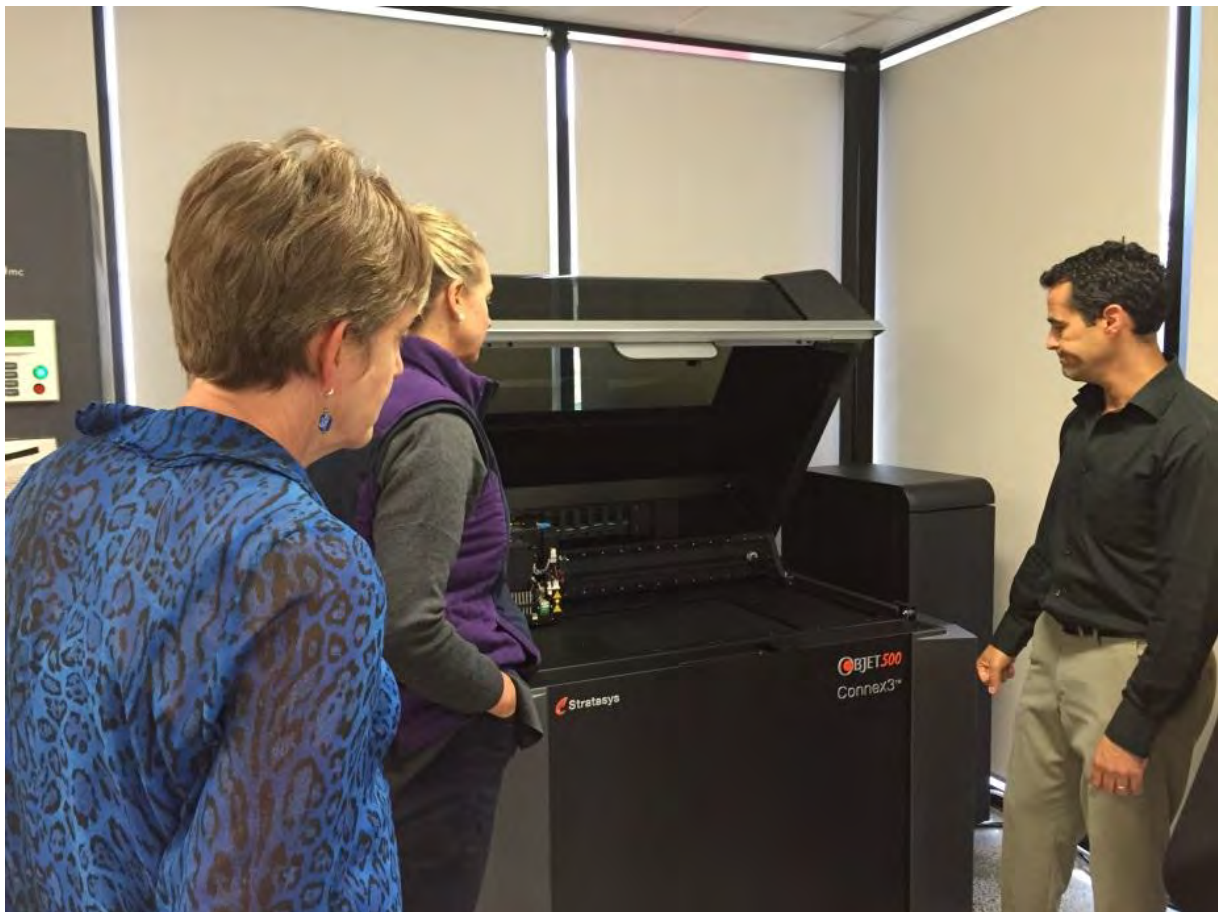
Figure 6.1: Committee members inspect a 3D printer