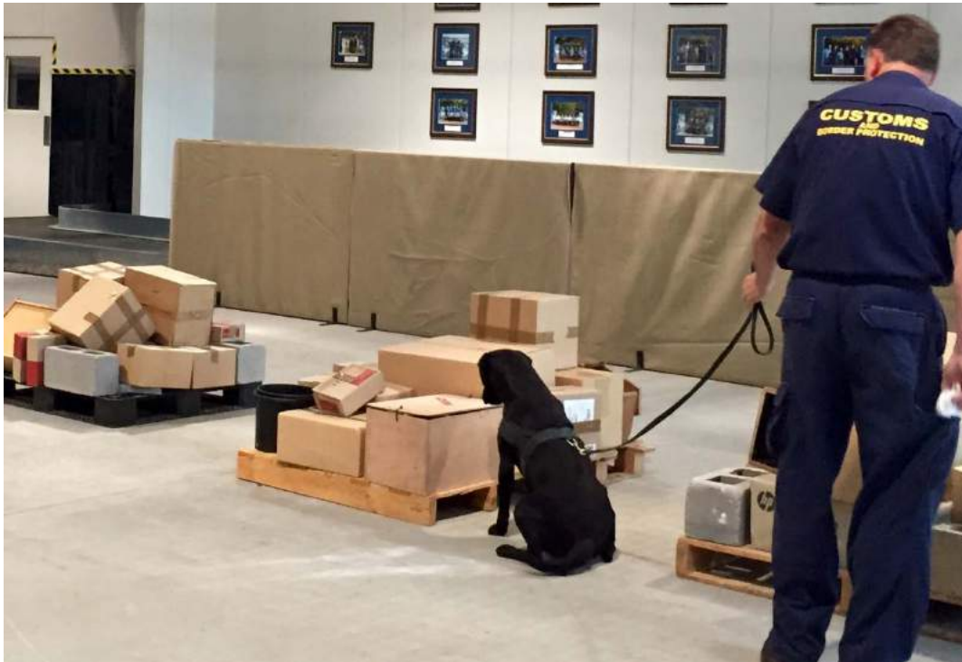
Figure 2.2: Detector dog alerting handler to the presence of explosives in the package as part of a training exercise

1.88 The committee would like to thank the customs officers at the National Detector Dog Program Facility for their time and the knowledge they imparted and commends them on the important role they play in protecting the community.