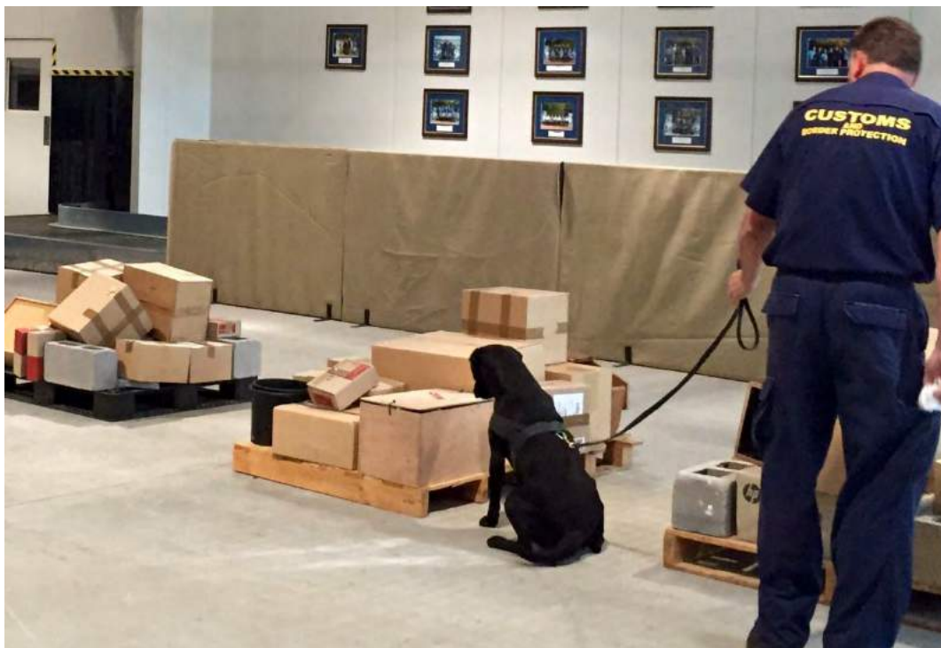
Figure 2.2: Detector dog alerting handler to the presence of explosives in the package as part of a training exercise

2.52 The committee would like to thank the customs officers at the National Detector Dog Program Facility for their time and the knowledge they imparted and commends them on the important role they play in protecting the community.